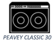
PEAVEY CLASSIC 30