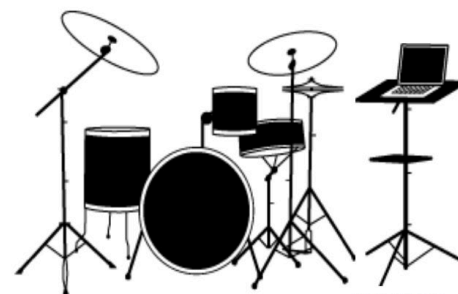
PEARL MASTER CUSTOM