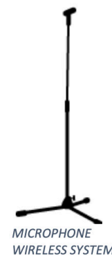
MICROPHONE WIRELESS SYSTEM